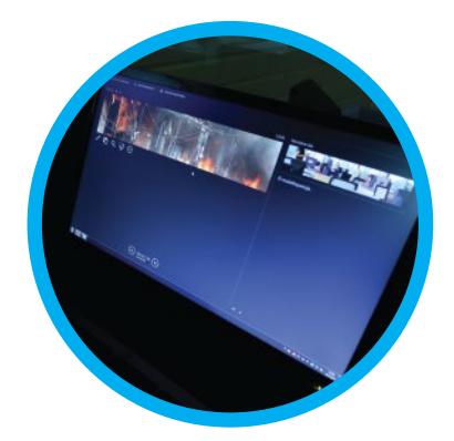
easy to use software

Ready-made background video clips and photos are supplied with the system, and it is easy for the customer to create additional backgrounds as needs dictate. By using the background in combination with Nordic SoundBoard, one can create a soundscape that corresponds to the background image, emphasising the sensation of reality in the virtual space.